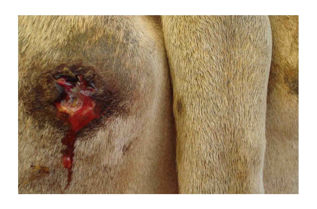
Paper presented at the Ford Cla Global Conference on Animal Welfare, 6-8 November, 2012 Kuala Lumpur, Malaysia