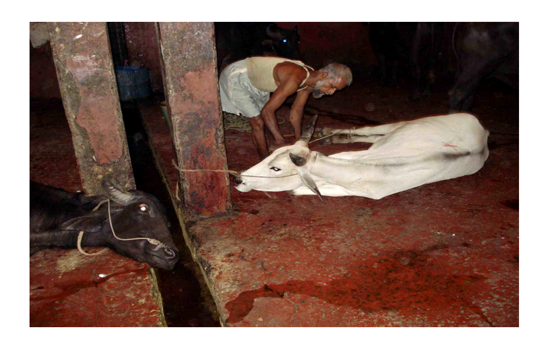
Paper presented at the Third OIE Global Conference on Animal Welfare, 6-8 November, 2012 Kuala Lumpur, Malaysia