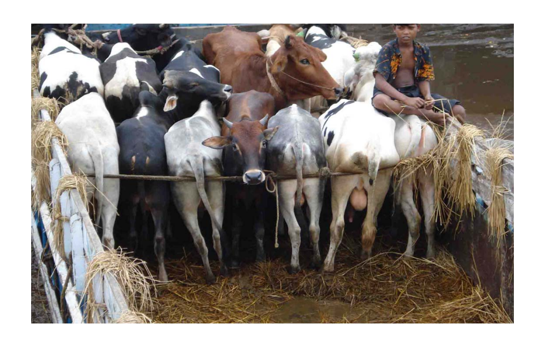
Paper presented at the Third OIE Global Conference on Animal Welfare, 6-8 November, 2012 Kuala Lumpur, Malaysia