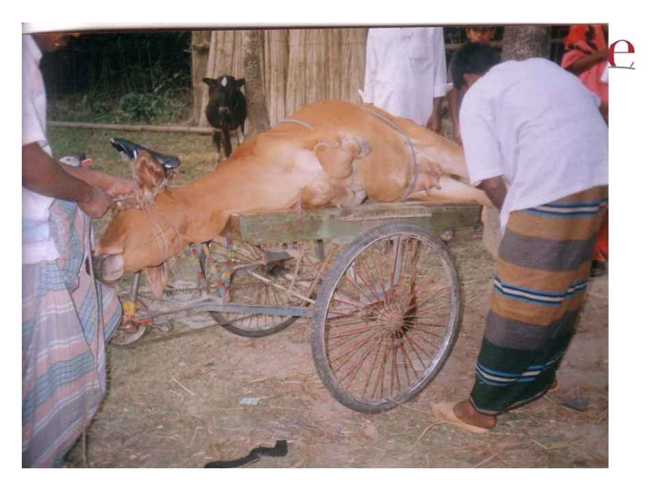
Paper presented at the Third OIE Global Conference on Artificial Welfare, 6-8 November, 2012 Kuala Lumpur, Malaysia