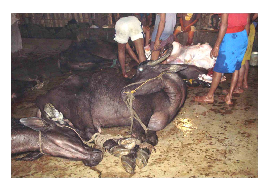
Papar presented at the Third OIE Global Conference on Animal Welfare, 6-8 November, 2012 Kuala Lumpur, Malaysia